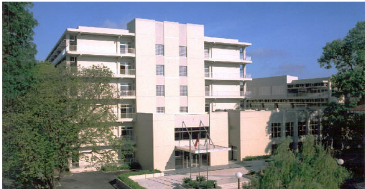
Bach Mai hospital