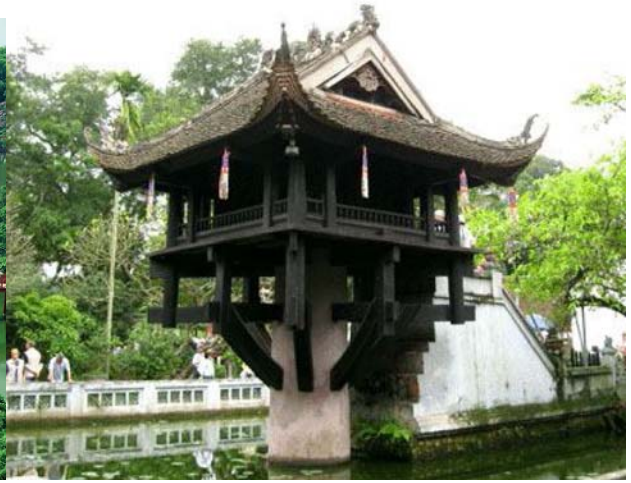
One pillar pagoda – the unique wooden structure symbolizing for Hanoi culture