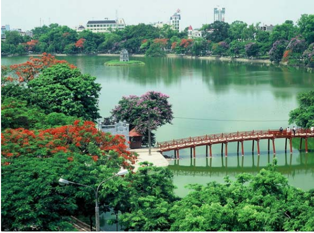
Hoan Kiem lake: a historical and beautiful site of Hanoi