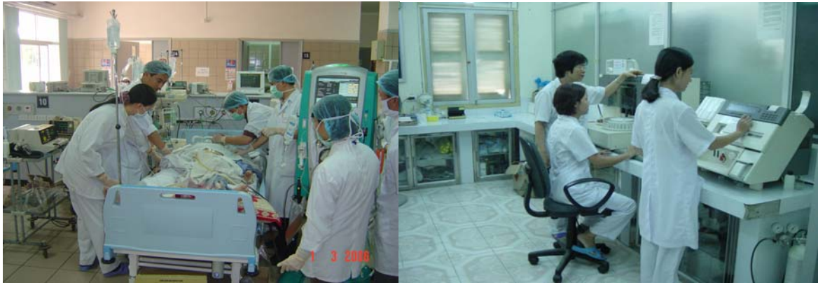
Treatment with CVVH and cardiac pace maker for a patient severely poisoned by blister beetle (cantharidin) and lead poisoning